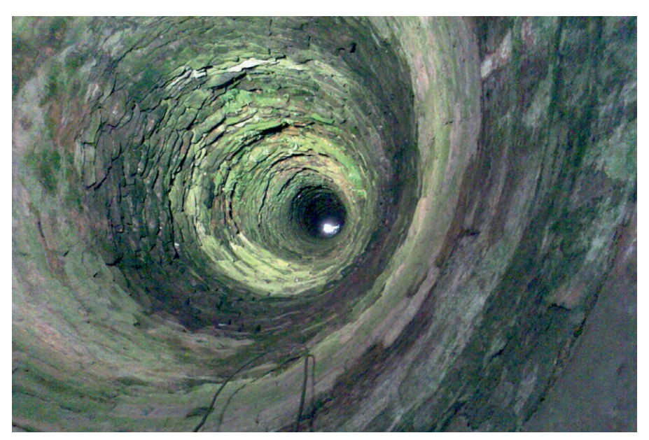
Fountain of the Marienberg Fortress, Wuerzburg, around 1200, depth 102 m

A prerequisite for sustainable groundwater protection is the monitoring and control of groundwater in terms of quality and quantity. This applies in particular to the protection zones and catchment areas of the water supply. The scope of the analysis needs to cover all substances being relevant for drinking water. This requires a monitoring network that is adapted to regional conditions and that allows a comprehensive and risk-oriented assessment for the protection of drinking water supply. Model calculations can support the data from monitoring networks. By no means can these models replace them to ensure safely and reliably identifying polluted areas. When designing monitoring networks for groundwater monitoring, care must be taken to ensure sufficient warning time in advance for water abstraction so that defensive measures can be taken in good time and adverse trends can be effectively reversed. In addition to monitoring, consistent enforcement in accordance with the precautionary and polluter pays principles is a key task of the administration